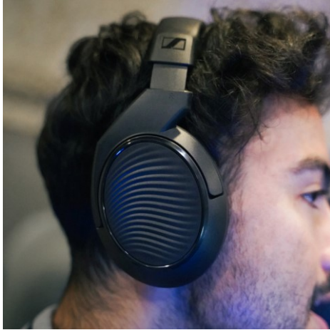
Your companion for powerful studio sound: the HD 200 PRO