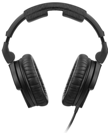
Give a professional edge with the HD 280 PRO monitoring headphones

An accurate representation of audio is key when mixing or mastering work. When you give the HD 280 PRO , you're gifting them a professional edge. Eloquent lows, a distinct midrange and clear-cut highs are what define the HD 280 PRO, making them the perfect companion for podcasters. The HD 280 PRO boast an extremely robust, collapsible design with swiveling ear cups and excellent noise isolation.